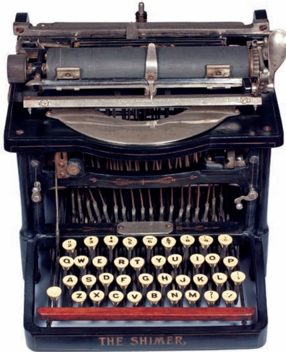
Martin Howard Collection

How many were produced? There is no definitive answer but it is almost certain that after a few early machines, the serial numbers started at 1,000. As a parallel, all known Granville Automatic typewriters have serial numbers in the 5,000 range.