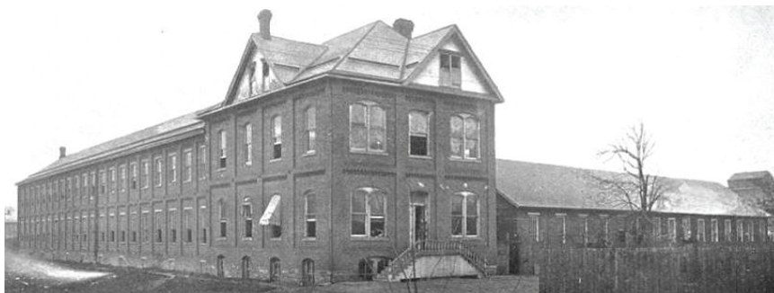
The Shimer factory as it appeared in the 1960s.

The few Shimer typewriters that were sold appeared on the market in 1899. The only known advertisement of the Shimer typewriter appears in the 1900 Shimer general catalogue for cutter heads. The two-page display ad is placed on the last two pages of the catalogue. The text expounds on the quality construction of the machine but the illustrations are drab with no visual appeal for a prospective buyer.